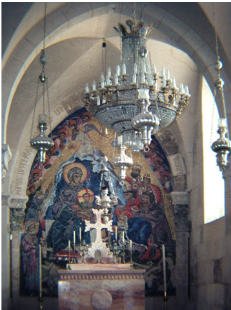
Church of the Nativity

I enjoyed my voyages on the Wild Auk most of all because, being a tramp ship, we never knew where we were going until the last minute, and even then, sometimes we were part-way to one country when orders suddenly changed and we'd turn about to head for somewhere else. It was so exciting being in the middle of the ocean somewhere in the world, out on the sunny deck, hanging over the rails watching out for flying-fish and dolphins and whales, waiting to hear of our destination! I reflected smugly that some people paid thousands of pounds to travel the world on luxurious ocean-going liners, and even then didn't have the wonderful and unusual experiences I was having - free of charge - on general-cargo vessels! I certainly wouldn't have swapped places with them for a mere bit of luxury!