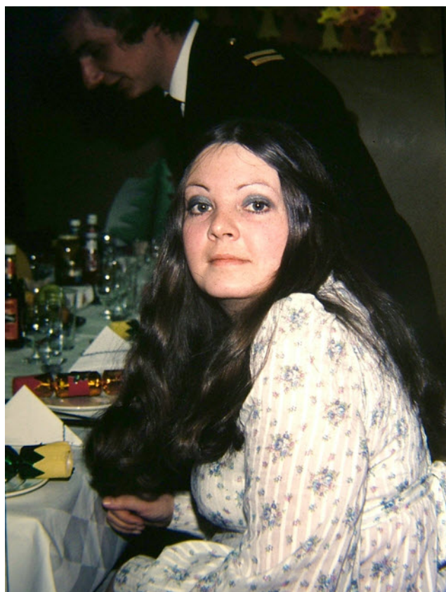
Christmas on the Belle Rose