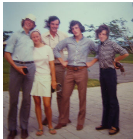
Run ashore in Curacao

For exercise we had the long expanse of deck, of course, and many ships had a big lounge with a Table-Tennis table, which was interesting during stormy weather with the ship rolling! A rowing machine was discovered lying about somewhere in the bowels of the Westmorland and, of course, everybody wanted to use it at the same time, which caused a certain amount of friction, until one day it disappeared and was never seen again. We had an energetic fitness-fanatic on board and we suspected it was stowed away in his cabin and used as part of his daily exercise regime, evidence of which was heard nightly from the bangs, thumps and groans emanating from his cabin above the bar. We also had a small library of books kindly lent by the Mission to Seamen, whose unflagging dedication to seafarers remains legendary. While between ports, Colin and I often stayed in our cabin playing Scrabble and Canasta (that's when we discovered I'm a bad loser), filling our glasses from our own supply of Portuguese reds; almost every sort of drink was available in the bar, but ship's wine was pretty basic stuff. Not so many people drank wine in those days, preferring beer and spirits.