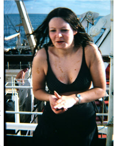
Soft soaped crossing the line victim

Homeward-bound on the Westmorland, as part of our cargo we carried a beautiful Golden Labrador, who was kept on a loose chain in his bespoke wooden kennel on the deck just outside the Officers' bar. He was a young dog, about three years old. A member of the crew was detailed to exercise him up and down the length of the ship every day and to feed and clear up after him. The dog's owner was flying back to the UK from New Zealand, but it was hard on the dog who, after a month on board a rolling ship among strangers, then faced six-months quarantine in England. But his owner clearly loved him - the cost of passage would have been considerable. I've always been fond of dogs and he was an affectionate creature, as I discovered when I crawled into his kennel to make friends and sit beside him. Immediately, he moved close and cuddled up and I stroked and massaged his ears and neck, his nose wet and shiny and great tongue lolling about. He was a dear thing, and he and I became great friends. Every time I passed the kennel or called his name he would rush out to greet me, trembling with excitement and pleasure!