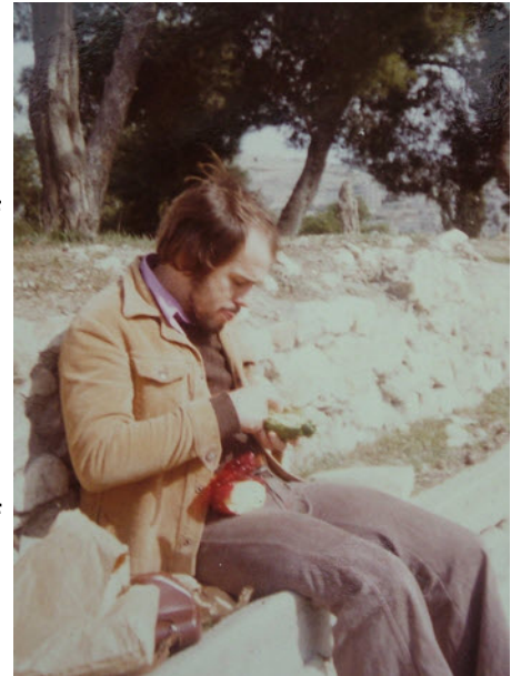
Avocados - Yum!

That night in the hotel the heat was so sticky and the room so stifling that we opened all the windows wide. At intervals throughout the night, across the city from all directions floated the sound of the Arab muezzin calling the faithful to prayer, cutting through the eerie silence of the city, and it was hard to sleep. The following day we visited some of Jerusalem's many Biblical sites. We bought a bag of avocados and sat on a rocky outcrop at Golgotha amongst raggedy sheep, surveying the beautiful old and new cities below as we ate them (the avocados, not the sheep).