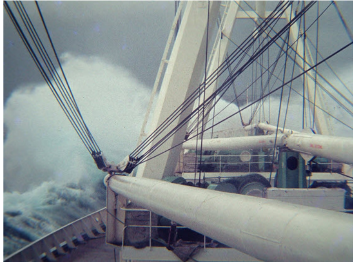
Bit Rough !!

During my last ever trip, homeward-bound on the Wild Auk, we were hit off Japan by the tail-end of a hurricane. We sailed into mountainous seas and howling, shrieking winds. The ship was in chaos, the accommodation a mess - everything, everywhere was all over the place. There was no let-up for two days. Lying in our bunks we were at the mercy of the ship's motion and slid helplessly up and down, rolling over from one side to the other and back again relentlessly as she corkscrewed, sleep an impossibility. It was exhausting, especially for those who had to work in it! The ship pitched and tossed heavily, seeming to smash herself down hard on the sea after the passing of each monstrous wave. I managed to get up the steps to the empty Owner's cabin on the top deck where I stared, terrified, out of the wide windows as the bow of our little ship plunged into gigantic waves, wall after wall of water hitting and momentarily darkening the cabin as they swept over her. I'd never been so frightened in my life! It was all I could do to remain standing; one minute we were falling, the next we were climbing, and I slid carefully, gripping the stair-rails tightly, back down the stairs to the main deck.