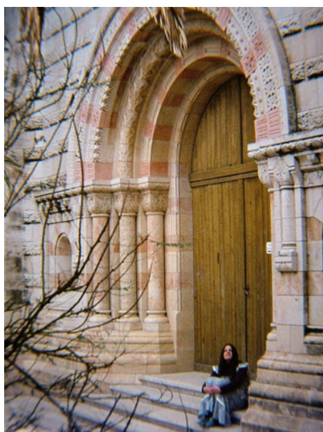
Me on Church Stairs, Jerusalem

I returned to the ship quite late and was surprised to find myself unpopular with the lads, who had become concerned for my safety. The Radio Officer was particularly annoyed, accusing me of being thoughtless and selfish. Looking back, I realise that he had a point: I'd been gone since 10am, using unfamiliar public transport, alone in a strange foreign city miles away from the port; they'd expected me back before nightfall and it was now close to 9pm. The only one not overly concerned was my husband, who I'm sure everyone thought was quite mad! At the time, with typically youthful thoughtlessness, I felt that they were behaving like a lot of old women. Thinking it would help to explain what a lovely day I'd had, I then made matters worse by confessing to having gone off into the hills in a taxi with two young Arab men and several others, all complete strangers to me!