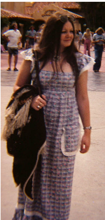
Me at Disney World

When we docked in Tampa, Florida, P&O arranged another trip for us and we travelled by mini-bus to Disneyworld, where we all thoroughly enjoyed the day. The Americans are very good at Leisure and promoting the atmosphere of Constant Fun. I'd thought it would be just a sort of smart fun-fair, but it was nothing like anything I could have imagined; I became immersed in a total suspension of reality, amazed at the technological wonders evident all through the park, and enjoyed it so much that I returned the following day with some of the crew who'd been working previously. We were also able to visit Disneyland during our stay in California, though we arranged that ourselves.