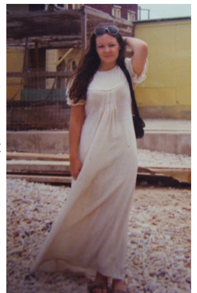
Ashore in Curacao

A personal routine soon established itself; my only jobs were tidying the cabin and doing our laundry, and my routine was to do them whenever I felt like it! One of the two wives on board on my second trip tried to establish a rota for using the laundry-room, but neither the other wife nor myself wanted to be regulated in this way, much to her disapproval! Neither did we wish to be part of a rota for cleaning the bar - that was the steward's job, and how the officers liked to keep their bar was really nothing to do with us. The Westmorland was the only ship I sailed on where there were no other wives on board and later, for various reasons, I decided that I preferred it that way; women can be strange creatures at times and are not always good to one another, especially in a strongly male environment. Perhaps it's a reaction to so much testosterone in a relatively confined space!