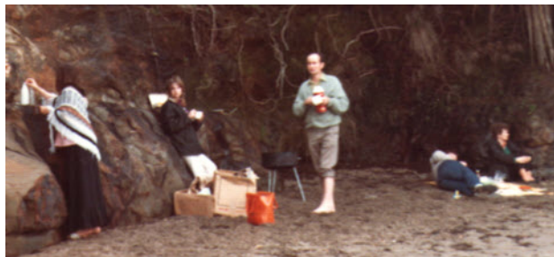
My Family in NZ

Our first proper port of call on the Westmorland was 'windy' Wellington (though the weather was bright and calm during our visit). I was full of suppressed excitement, trying not to let it show (oh wow! I can't believe it! I'm in New Zealand!), looking out through the bar doors at the wide, beautiful harbour with its tall fountain playing on the waterfront.