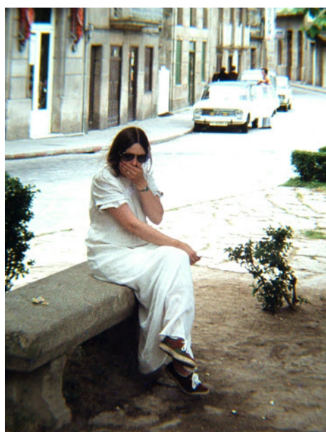
Me in Vigo

nearly in tears. Other customers drinking at the bar stopped talking and stared at us with curiosity. We felt they were on our side as they began to murmur and nod their heads, though in reality they were probably just agreeing how crazy the English are! She tried everything to make us accept the unavailability of the dish: "NO NO NO!!" "P-l-e-a-s-e.... P-a-e-l-l-a!" She stared - she muttered a stream of words under her breath - she threw her arms in the air - "OK! OK! PAELLA!" Defeated (again!) by the English, she retired to her kitchen and cooked up a large, delicious concoction of rice, saffron, fresh seafood, chicken and peppers, just for us! I suppose it was either that or throw us out! We waited an hour for it and drank copious amounts of local red wine, but it was worth it! We ate as much as we could, ashamed