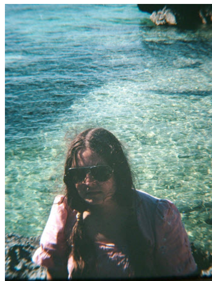
Me in Bermuda

I'd only recently finished reading 'The Bermuda Triangle', all about strange disappearances in the region of aircraft and ships together with their crews, so when orders came to pick up a cargo in Bermuda I viewed the crossing with some trepidation, half-expecting at any moment to be beamed up into an alien spacecraft or dragged below the waves by some malign, unseen force, but the journey passed uneventfully, and to my relief we arrived safely.