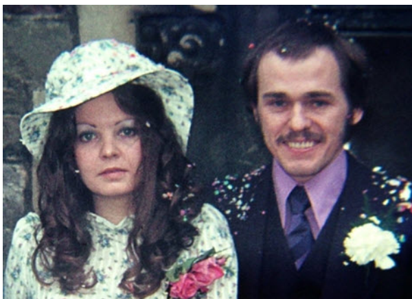
Our Wedding day

The following evening we went out to a Berni Inn (remember those?) for steak and a bottle of Mateus Rose. I'd had neither steak nor wine before, so I thought this was really living the high-life! The evening after, he invited himself to my bedsit for dinner, where he was astonished to be offered a plate of baked beans on toast which, I explained, was the staple diet of girls in bedsit-land. So he took me out again instead, not being a fan of baked beans apparently ... or perhaps he just felt sorry for me!