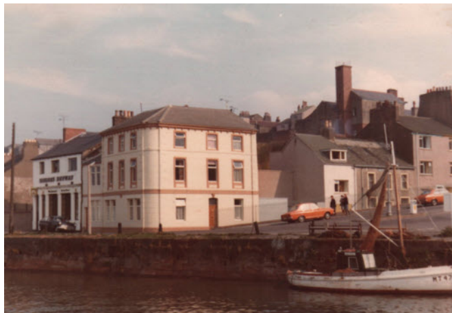
House in Maryport - Lake District