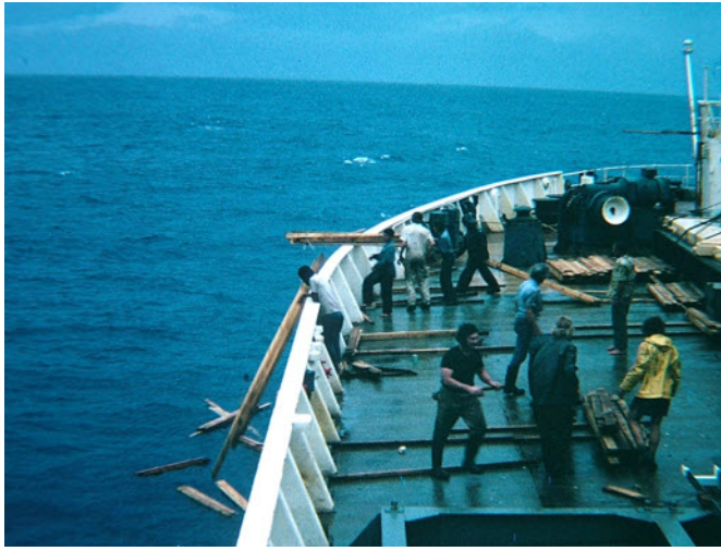
Dropping off cargo at Pitcairn Island