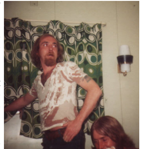
I've got a son !!