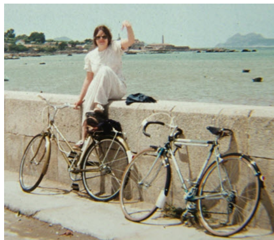
Me with our two bikes in Vigo

While docked in Sheerness waiting to sail on our second trip on the Tongariro, we nipped into Rochester and purchased two bicycles, which we took on board and stored in the engine room cross alleyway. They came half way round the world and back with us. I've cycled in Bermuda, Australia, New Zealand and Holland, sometimes with Colin, often alone. The freedom was wonderful. It's amazing how much you can see on a bicycle that goes un-noticed in a car. In the port of Vigo, Western Spain, after a good long cycle we left our bikes outside a bar/restaurant and went inside for some dinner. This was not a tourist area. Nobody spoke any English, we spoke no Spanish, and all we recognised on the menu was 'Paella'. The middle-aged, floral-aproned maitre'd shook her head vigorously, and using sign-language told us there was no Paella on today. She was adamant. "NO Paella!" We begged, we pleaded, we almost got on our knees. "NO PAELLA!" We were