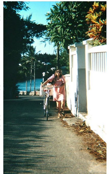
Me in Bermuda