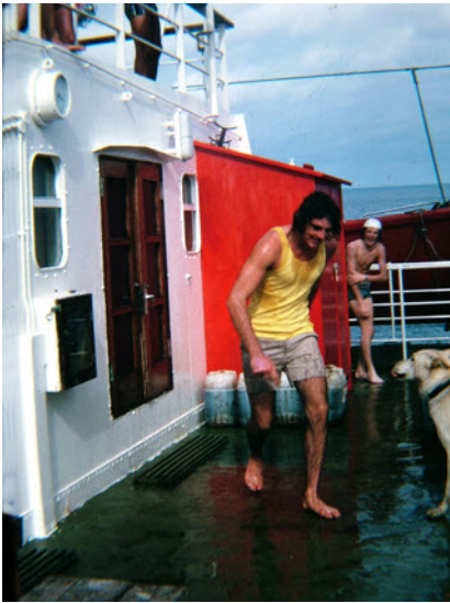
Got with the bucket of water

himself in his cabin; but when someone shouted that a pod of Whales had been spotted, out he rushed only to be met as he stepped on deck with a face-full of soft-soap and half-a-dozen buckets of cold sea-water from the deck above and from either side. After that he gave up and joined in. It was a hilarious few hours, but it took me ages to get rid of the soft-soap in the shower afterwards because my hair was very long and stuck out with thick clumps of the disgusting stuff!