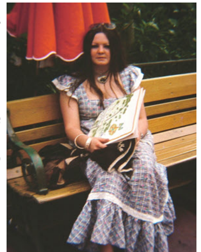
Me at Disney World

I went off on my own a lot; nearly every day we were in port I went somewhere. Travelling the world was such an unexpected and amazing experience that I was determined to make the most of it, and I did! On one trip, the two other wives on board found they had a lot in common and became instant friends; but neither of them seemed to share my sense of adventure and often