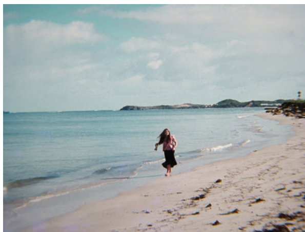
Me on an Aussie Beach

I loved NZ - what a beautiful country! My family took me touring in their battered old Rover, which had one door tied shut with rope (it being often difficult to obtain spare parts for these much-loved old English cars), and we visited hot volcanic springs, saw various ancient Maori artefacts and buildings. We took a look in Auckland's Modern Art gallery, where my Uncle took out a bit of old rubbish he'd picked out of a roadside bin and surreptitiously placed it amongst a display of contemporary sculpture, where to our great amusement it remained for some weeks before it was spotted and removed!