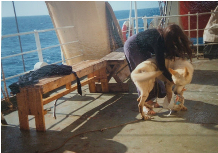
Me and the Dog